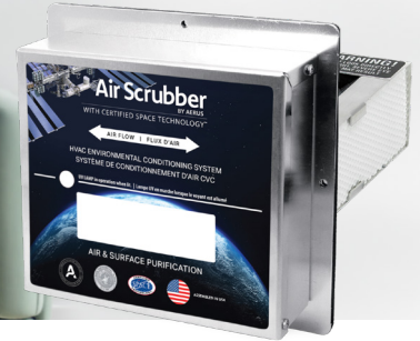
New Patented Cell Design